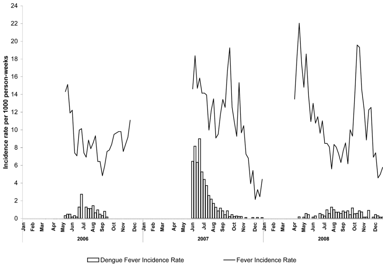
Figure 2. Incidence of Febrile Illness and Dengue Fever by Week, Kampong Cham Province, Cambodia, 2006–2008. doi:10.1371/journal.pntd.0000903.g002

(11.3% vs. 14.5%; adjusted OR 3.1; p = 0.045 ) ( Table 4 ). Of note, when considering only year 2007, DENV-3 infection was also associated with higher frequency of hospitalization when compared with DENV-1 (15.7% (34/216) vs. 4.4% (4/90), p = 0.006 ).