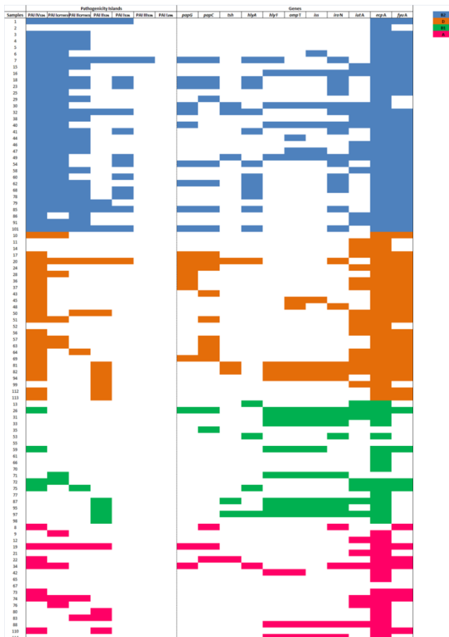
Figure 3. Study of pathogenicity islands, phylogenetic classification, and virulence genes in 96 ExPEC strains from human. In blue are the samples belonging to phylogenetic group B2; in orange, the samples belonging to group D; in green, the group B1; and finally in pink, samples related to group A.

The PAI sequences were also present in some commensal faecal isolates although less often (52%) than in ExPEC strains (78%). The distribution of PAI sequences in ExPEC samples in this study also corroborates the results published by Sabaté et al. [6]. PAI IV 536 , reported as the most common in UPEC, was found most frequently in our strains (Figure 2). This PAI is quite stable in E. coli 536 (originally isolated from a patient with acute pyelonephritis) which could explain its high frequency in our strains as well. The PAI III 536 , which is classified as unstable, easily lost and not required for virulence [6], was present in a low percentage of ExPEC (1.04%). The majority of strains that had PAI sequences belonged mainly to phylogenetic group B2, and the strains that belonged to group B1 had few PAI sequences, which leads us to conclude that the virulence of ExPEC strains characterized as B2 is likely attributed to PAI encoded genes, whereas the virulence of ExPEC strains belonging to phylogenetic group B1 is likely due to plasmid encoded virulence genes (Figure 3).