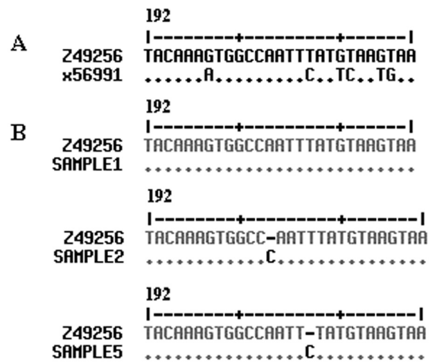
Fig. 2 – A: Sequence differences between E. dispar (Z 49256) and E. histolytica (x 56991) ribosomal RNA genes. B: Sequence differences between E. dispar (Z 49256) and E. dispar ribosomal RNA genes identified in the stool samples. * Nucleotide sequences identified in samples 4, 7, 8, 9 and 10 are identical to those of sample 2.

ficant alignments were obtained for all samples with E. dispar gene for ribosomal small subunit (EMBL accession Z49256). Very few nucleotide differences have been shown around position 190 where considerable number of nucleotide polymorphism with E. histolytica is reported (Clark & Diamond, 1991) (Fig. 2A). Six samples have shown a punctual insertion in position 204, whereas sequences were identical to the reference strain in one case and presented an insertion in position 208 in another case (Fig. 2B).