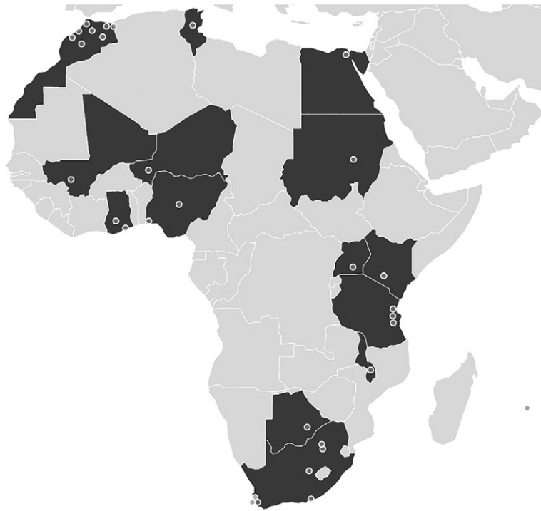
Figure 1. Map of Africa showing the distribution of nodes in the H3ABioNet network. The dot on the right is for Mauritius, and two additional sites not shown include one in the USA and one in the UK.

The mandate of H3ABioNet ( http://www.h3abionet.org/ ) is to develop and roll out a coordinated bioinformatics research infrastructure that is tightly coupled to a sophisticated pan-African bioinformatics training program. In modern genome sequence analysis, analytical tools are moving to where the high dimensional data are stored, so the expertise for genome data manipulation and analysis in Africa are being developed at the source of these data. The network seeks to exploit the development and implementation of best practices in genome bioinformatics in local centers while keeping an eye on the rapidly evolving field through collaboration with centers of expertise in