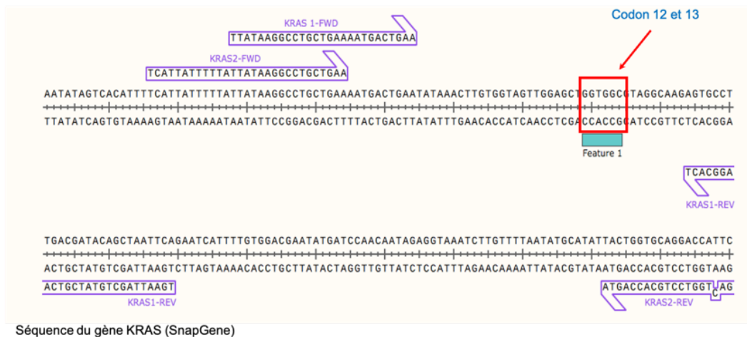
Figure 1. Representation of a portion of the KRAS gene. Boxed in red, codons 12 and 13 of exon two of the gene. Purple box: the sequence of primers used for the amplification