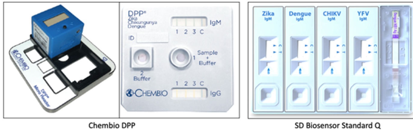
Figure 1. Chembio Diagnostics DPP ® ZCD IgM/IgG (Zika/Chikungunya/Dengue IgM/IgG) System and SD Biosensor (SDB) STANDARD Q Arbo Panel Test. The Chembio ZIKV, CHIKV, and DENV multiplex serology assay system consists of a single cassette where the sample and buffer are placed are placed into a well marked 1 and a second buffer added into well 2. The results are read by placing a RFID microreader over the IgM and IgG windows where result for Zika antibodies can be read in Line 1, chikungunya virus antibodies in Line 2, dengue virus antibodies in Line 3 and C is the control line. For the Chembio Diagnostics DPP ® Zika IgM/IgG System, the test cassette is similar to the ZCD IgM/IgG system except that each result window only contains 2 lines, one for the zika antibodies and the other for the control line (picture not shown) . SD Biosensor (SDB) STANDARD Q Arbo Panel Test: the SD Biosensor assay is an immuno-chromatographic assay for the detection of Dengue NS1 Antigen and IgM antibodies to Zika/Dengue/Chikungunya/Yellow fever virus. It consists of 5 separate cartridges, where each requires specimen and buffer addition. The results can be read visually.